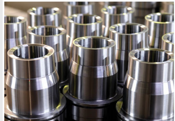
Ability to produce components from a variety of materials including aluminium, brass, bronze, copper, duplex, plastics and numerous steels.