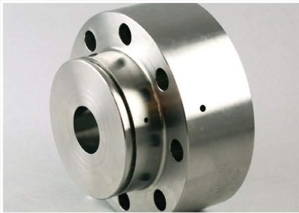
Ability to cater for small one-off requirements to large orders of complex components.