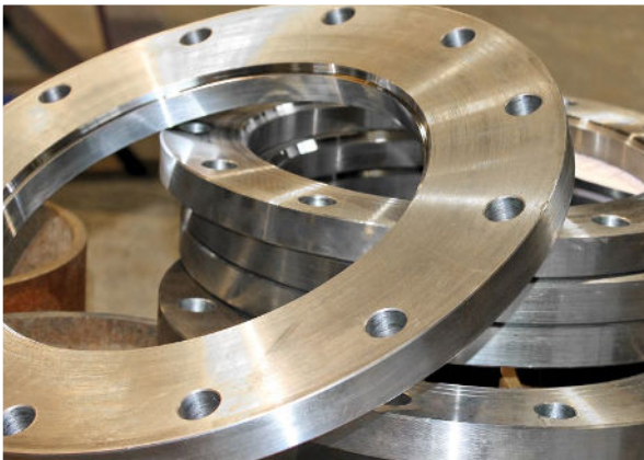
Customised components for all industries including mining, construction, industrial, agricultural, marine, transport and automotive.