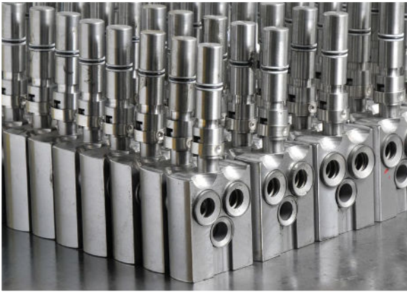
In-house design and manufacturing team combined with expert tradesmen allows for customised innovative solutions.